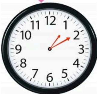
It's ten past one