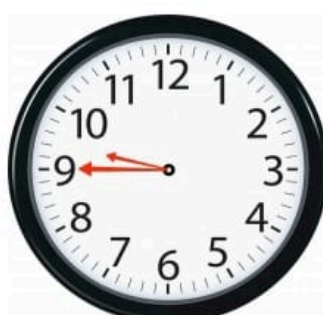
It's a quarter to ten